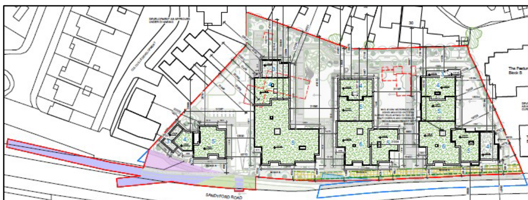
Figure 3.1 Proposed site location and Layout

The proposed development which has a gross floor space of 13,144 sq m (over a part-basement/part-undercroft level measuring 4,508 sq m, principally providing car and cycle parking and plant) also includes: internal communal amenities and support facilities (404 sq m); 137 No. car parking spaces, which include 127 No. spaces and 6 No. GoCar spaces located at basement level (accessed beneath Block B) and 4 No. set down spaces located at surface level adjacent to Block A; motorcycle parking spaces; cycle parking spaces; bin store; substation; switch room; meter rooms; plant rooms; new telecommunications infrastructure at rooftop level including microwave link dishes concealed in shrouds; hard and soft landscaping, including communal amenity space; private amenity space with balconies facing north, south, east and west; boundary treatments; and all associated works above and below ground.